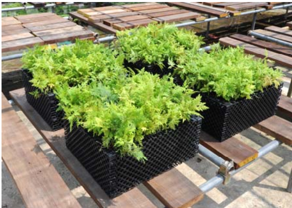
Modules growing flat in nursery (1-3 months grow-in required)